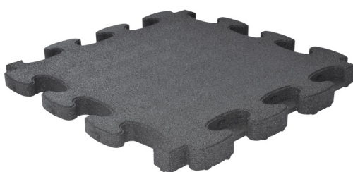
Puzzle Mat 3D® Gymallrounder